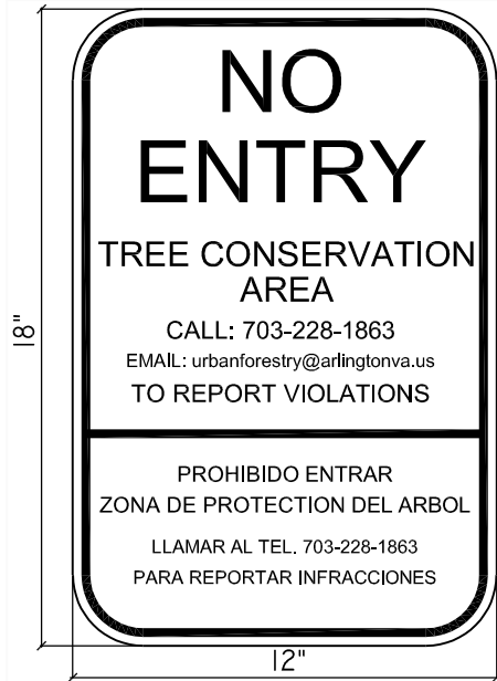
SIGN ENLARGEMENT 2" = 1'-0"