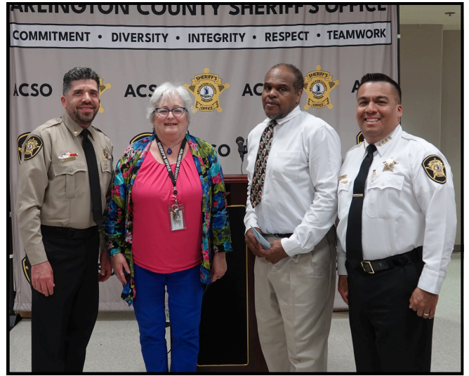
APS ESL and GED instructors

Throughout the coming months, we will be highlighting individual partnerships, sharing stories, and spotlighting the volunteers who make this work possible. Be sure to follow us on Instagram, Facebook, and LinkedIn to learn more about the programs happening behind the scenes and the people helping to make a difference. Together, we are building pathways to opportunity and strengthening the Arlington community one partnership at a time.