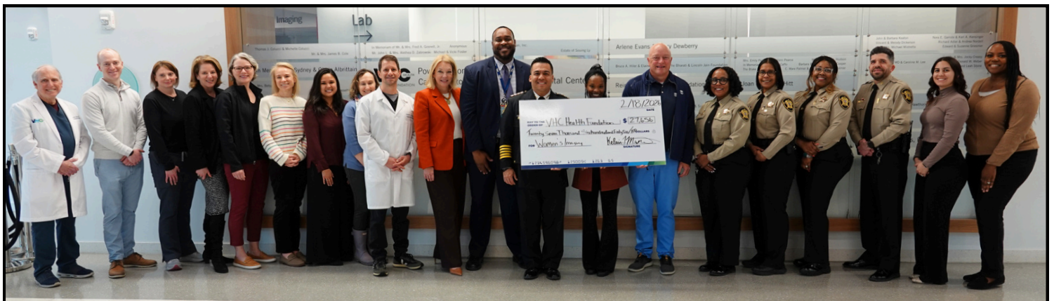
VHC Health staff, Sheriff Quiroz, sponsors from Sodexo and Koons Toyota along with ACSO staff