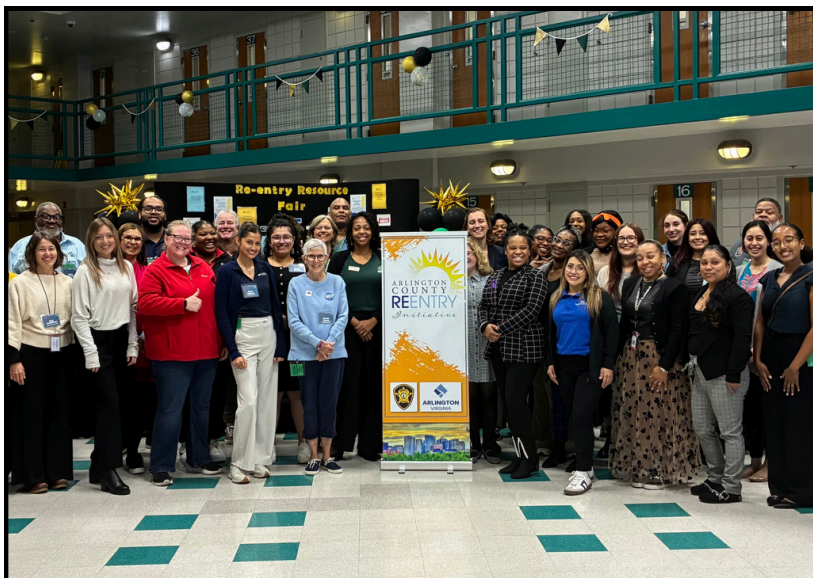
Jail Re-entry Fair with many of our partners