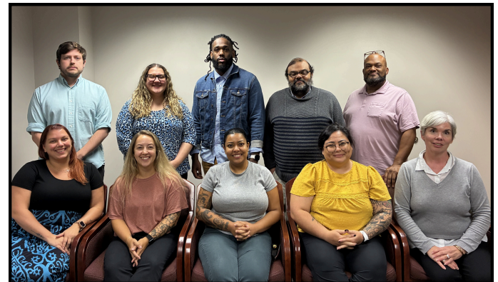
Jail-based DHS team