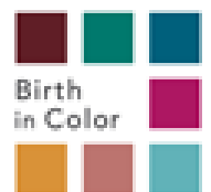
Birth in Color, nonprofit Doula Program partner