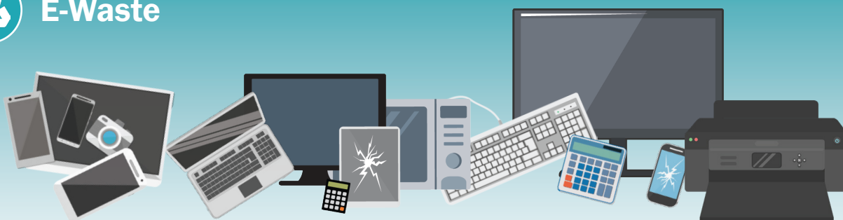
televisions, cellphones, monitors, CPUs, printers & cartridges, cords

For e-waste disposal location and hours please visit, https://bit.ly/achhm .