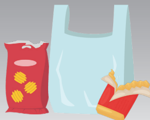
chip bags, candy wrappers, plastic bags