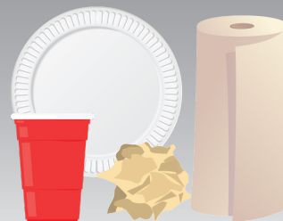
disposable plates & cups, paper towels, napkins