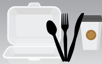
foam take-out containers, plastic utensils, coffee cups & lids