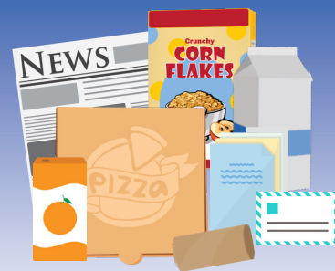
mixed paper, newspaper, cereal & food boxes, cardboard, beverage cartons

*Do not place recyclables in plastic bags. Place items in recycling containers: EMPTY, CLEAN & DRY.