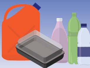
plastic bottles & containers