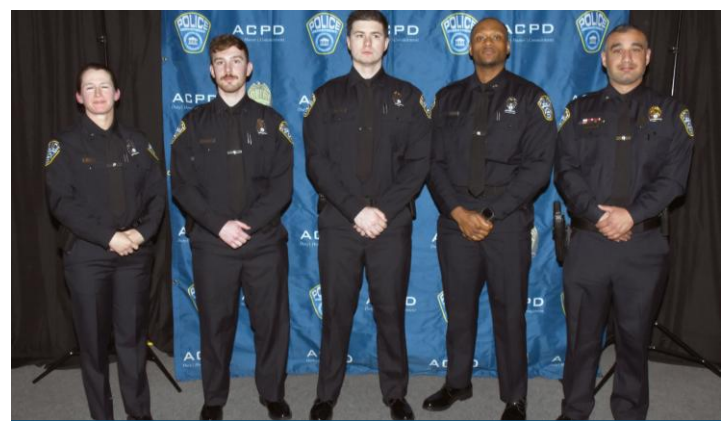
ACPD held a swearing-in ceremony for a lateral transfer officer as well as recognized officers recently promoted to the rank of Sergeant and Corporal. Congratulations to all!