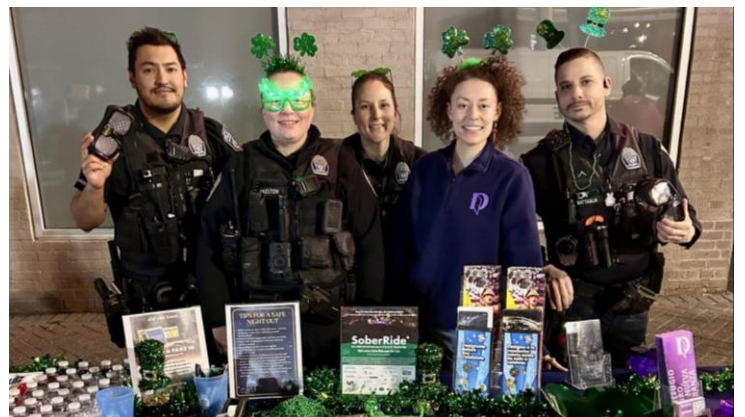
The Business Outreach Unit held its annual St. Patrick's Day Sober Ride event in Clarendon on March 14. Over 70 patrons signed the pledge to not drink and drive and tried out our impairment goggles!