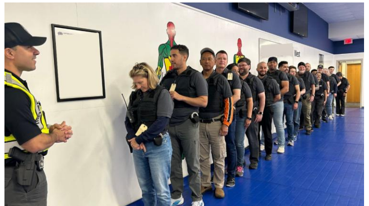
Members of the 30 th Community Police Academy enjoyed an Experience Day on March 30 at the Northern Virginia Criminal Justice Academy where they suited up and participated in hands-on training scenarios.