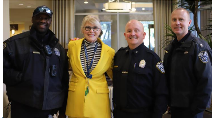
ACPD attended Culpepper Gardens 6 th annual First Responders BBQ on March 18. We are so grateful for their continued partnership and support!