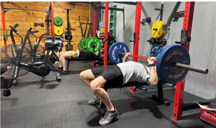
During First Responder Wellness Week, officers learned about their health benefits, attended fitness classes and received free biometric screenings. Health is wealth at ACPD!