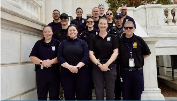
Members of ACPD's Honor Guard had the privilege of visiting the Tomb of the Unknown Soldier at Arlington National Cemetery and meeting with the sentinels who stand watch over the memorial.