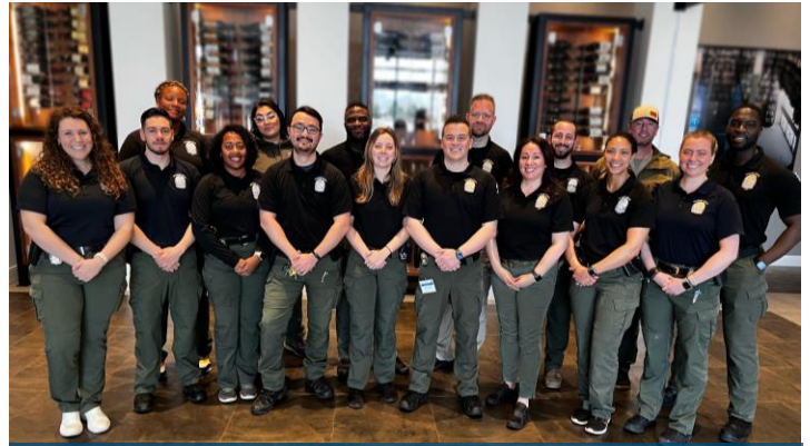
Members of the Crisis Negotiations Unit (CNU) attended the 43rd Annual Hostage Negotiator Seminar in Baltimore, Maryland during the week of March 7.