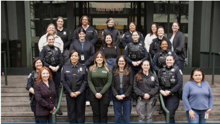
ACPD kicked off Women's History Month by acknowledging female personnel who serve in many different roles within the department and the invaluable impact they have on our community.