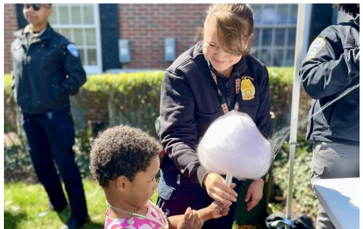
The Community Engagement Division held pop up events in the Green Valley and Buckingham neighborhoods to celebrate spring break and enjoy some cotton candy, snow cones and games!