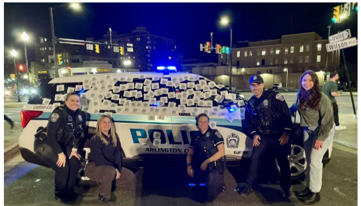
ARI had over 120 patrons make the pledge to not drink and drive at the Don't Press Your Luck anti-drunk driving event over St. Patrick's Day weekend in Clarendon.