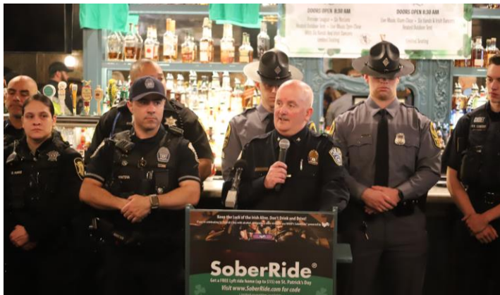
Chief Penn discussed the dangers and consequences of choosing to drive drunk and options to arrive home safely at WRAP's 2024 St. Patrick's Day SoberRide Campaign at Ireland's Four Courts.