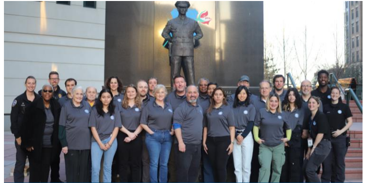
Beginning in February and through the month of March, participants of the 28th Community Police Academy have enjoyed lectures & Q+A sessions on a wide range of policing topics.