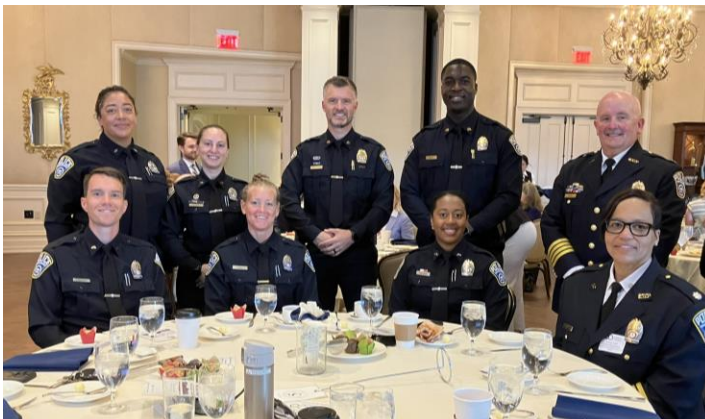
Members of the Arlington County Police Department were recognized during the Arlington Chamber of Commerce State of the County & Public Safety Awards for exceptional performance of their duties.