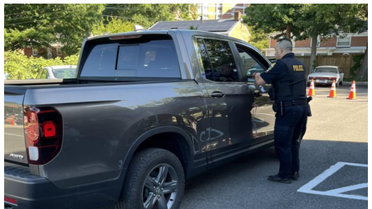
Arlington County and the City of Falls Church hosted a drive-thru Gun Buyback event at Arlington Assembly of God on June 8. In total, 134 firearms were voluntarily turned into law enforcement during the event.