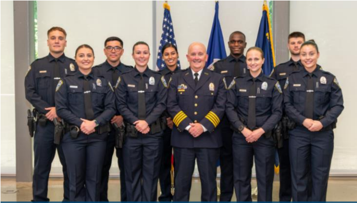
Friends, family and coworkers gathered on June 17 to celebrate the graduation of ACPD's nine newest officers from the Northern Virginia Criminal Justice Training Academy.