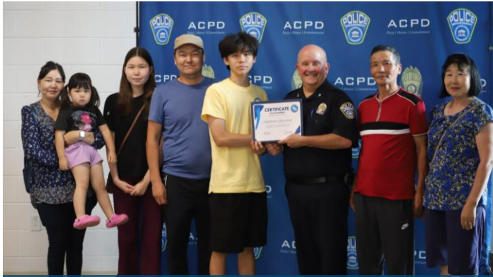
Family and friends were invited to attend their loved ones' graduation from the 2025 Summer Teen Police Academy. The overflow of support was felt by all.