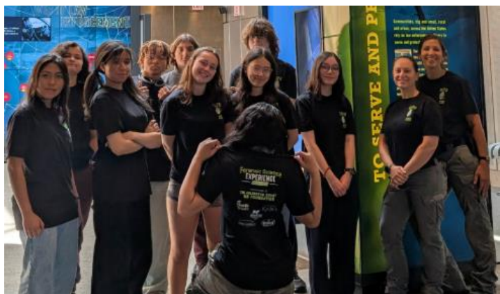
Students in the Forensic Science Experience, a week-long camp hosted by our Crime Scene Unit, visited the National Law Enforcement Museum and put their policing knowledge to the test!