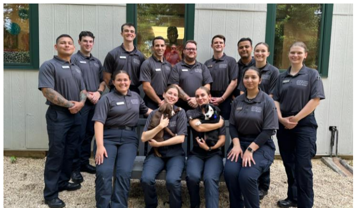
ACPD's pre-academy recruits visited the Animal Welfare League of Arlington to learn more about animal control resources, meet adoptable animals and assist with some facility cleaning.