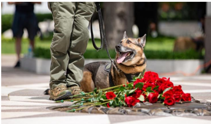
With profound sadness, The Arlington County Police Department and members of the K9 Unit announced the passing of retired K9 Duke, a 12-year-old German Shepherd.