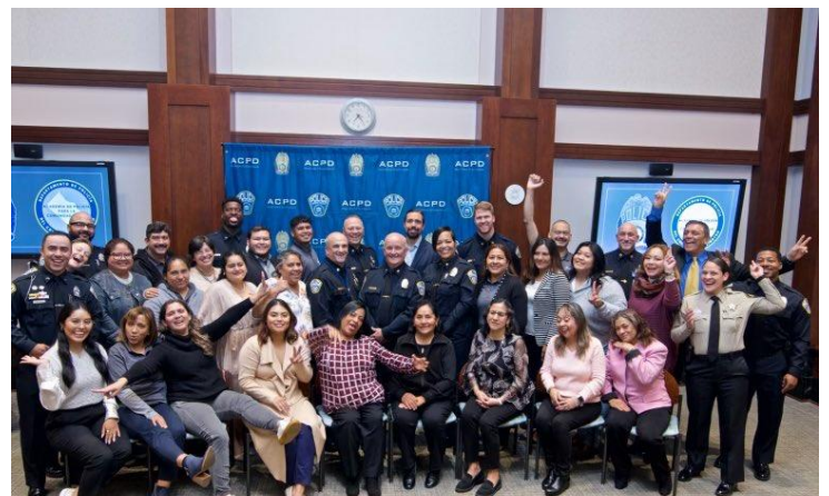
Members of the 2023 Latino Community Police Academy graduated on November 2. We thank them for their commitment to learning more about ACPD, their active engagement and thoughtful discussions.