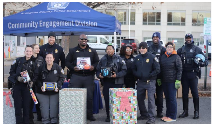
Members of the Community Engagement Division continued the Fill the Cruiser in-person collection events on November 25 at Arlington Assembly of God and Central Library.