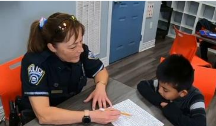
ABC 7 News highlighted the partnership between ACPD, AHC Inc., and LEC allowing sworn and civilian staff to tutor students in reading during after-school programs.