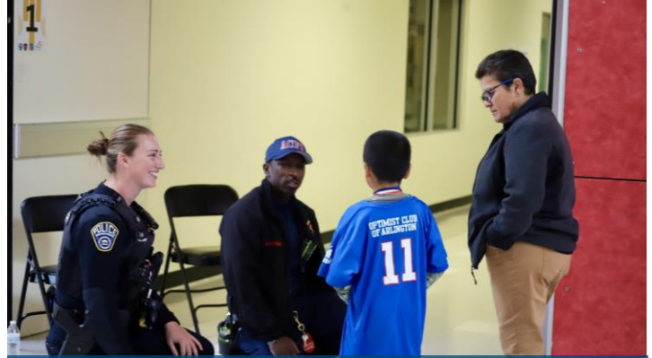
Police and Fire personnel partnered with The Arc of Northern Virginia for another 'Practice Emergency Interactions' event where participants were guided through missing persons training scenarios and more.