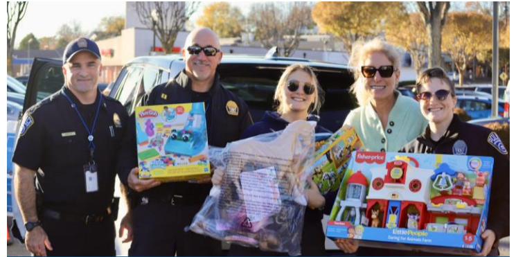
The Community Engagement Division kicked off the Fill the Cruiser holiday toy drive events on November 18 at Westover Baptist Church and the Lee Harrison Shopping Center.