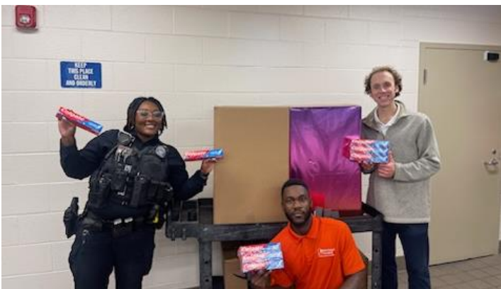
With the winter months approaching, the Community Engagement Division distributed backpacks filled with cold-weather items collected during ACPD's Essentials Drive to our community partners.