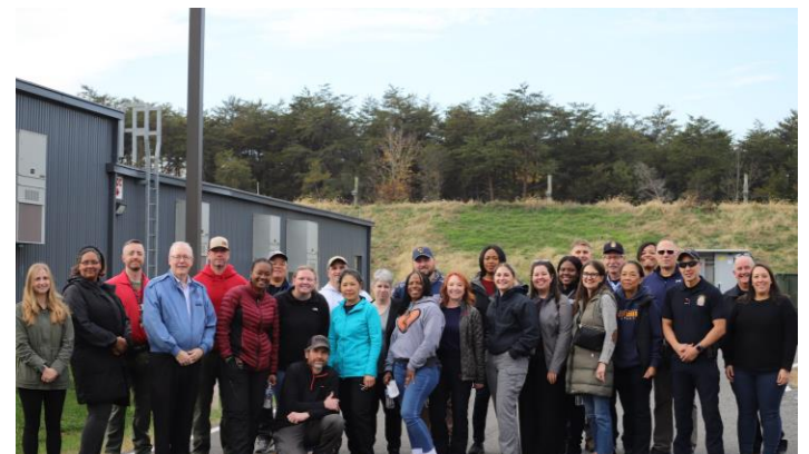
The Tactical Training Unit hosted civilian staff and Department chaplains at our firearms range and provided an overview of the training officers receive in order to maintain a high level of firearms proficiency.