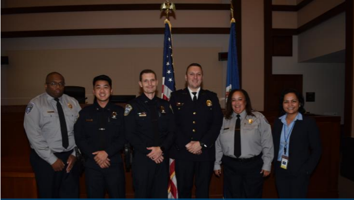
ACPD held a promotional ceremony to formally recognize recently promoted officers and civilian staff. Please join ACPD in congratulating each of them on their hard work and continued dedication to the Arlington community.