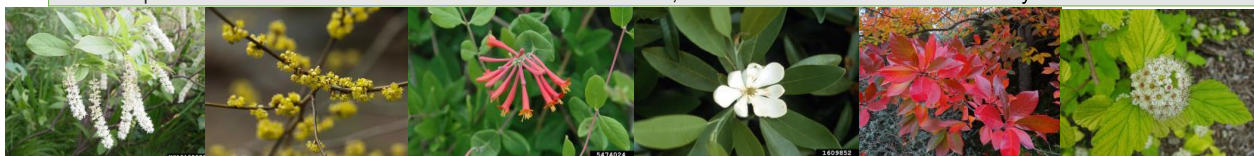
Sweetspire Spicebush Coral Honeysuckle Sweetbay Magnolia Sweetgum