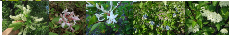
Black Cherry Pinxter Azalea Swamp Azalea Highbush blueberry Blackhaw viburnum