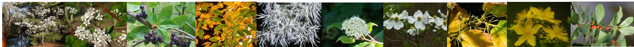
Canadian Serviceberry Red chokeberry Black chokeberry Ironwood Fringe Tree Silky Dogwood Flowering Dogwood Witch Hazel Shrubby St. John's Wort Winterberry