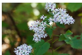
White Wood Aster