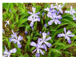
Dwarf Crested Iris