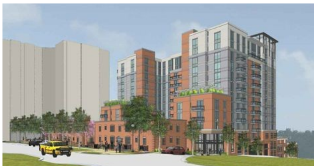
The redevelopment of Pierce Queen apartments will add another 28 rental CAFs

In FY 2013 the County added 55 Committed Affordable Rental Units (CAFs). Since 2000, Arlington has created more than 3,400 rental CAFs.