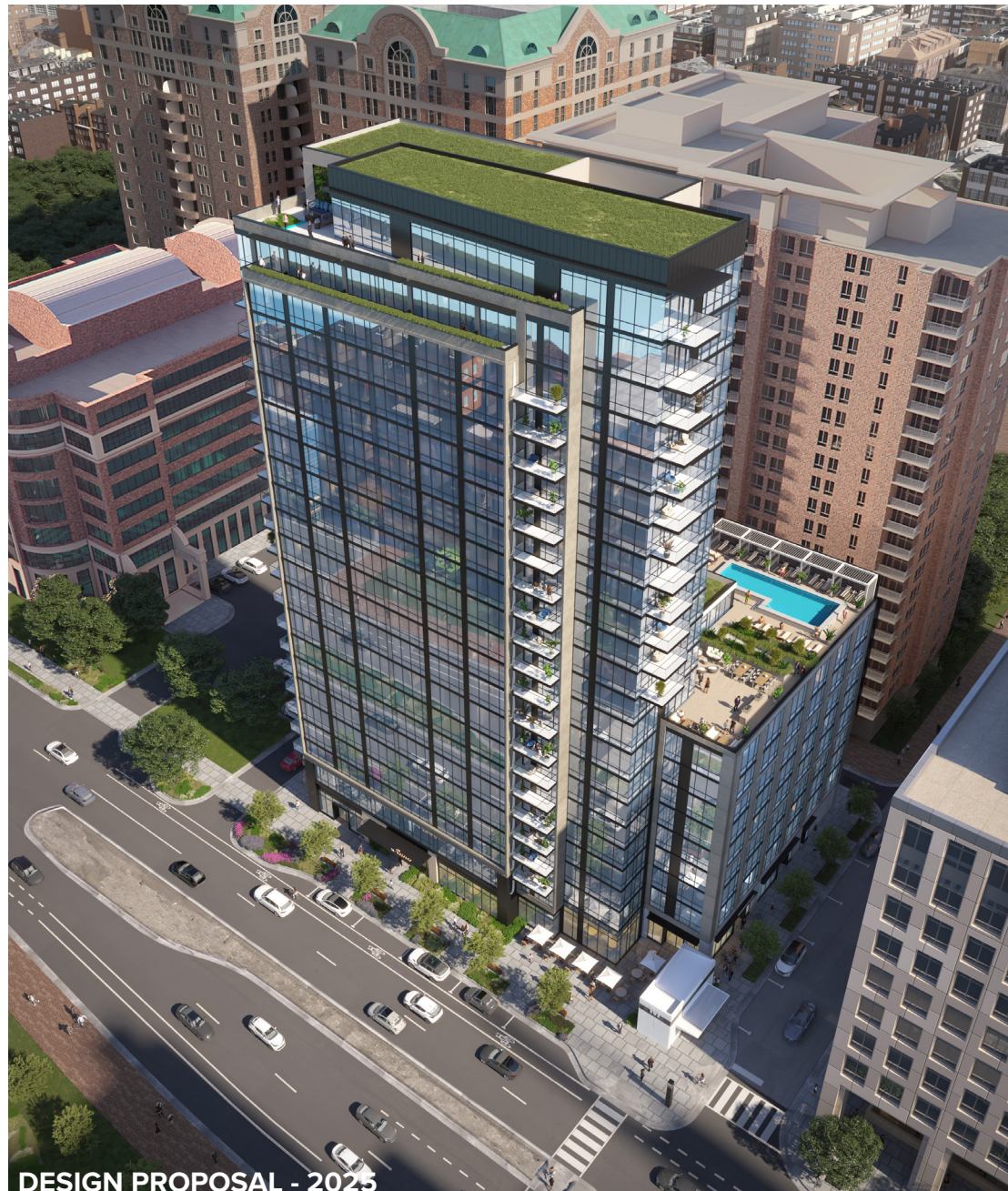
DESIGN PROPOSAL - 2025