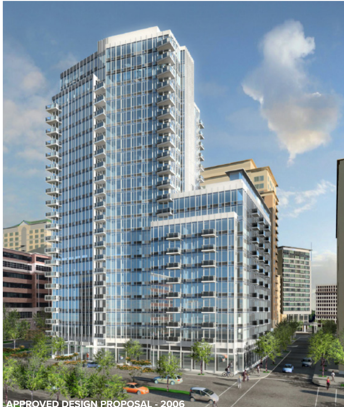
APPROVED DESIGN PROPOSAL - 2006