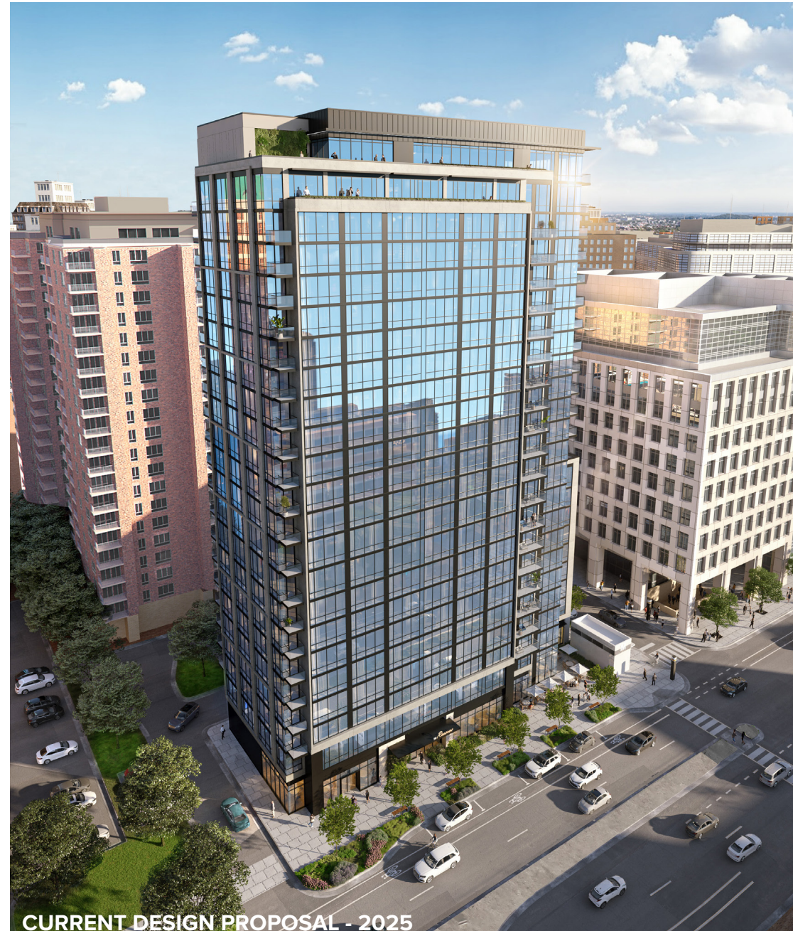
CURRENT DESIGN PROPOSAL - 2025