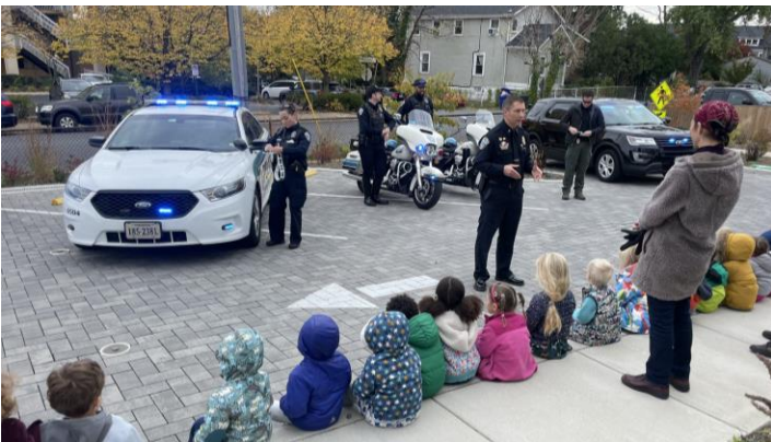
Members of ACPD's Training Unit, Special Operations Section, Patrol-Adam Squad & Community Engagement Division visited students at the Metta Montessori School and conducted a safety presentation.