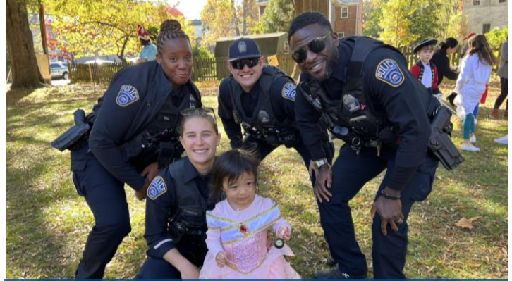
Members of the Community Engagement Division and Patrol - Adam Squad had the pleasure of meeting royalty at the Dominion Hills Halloween Parade. We enjoyed seeing everyone's costumes!