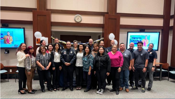
Congratulations to the graduates of the Latino Community Police Academy! We appreciate the time they invested in learning more about the agency!