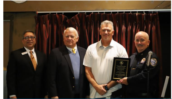
The Arlington County Police Department's Organized Crime Section was recognized at the 2022 Arlington County Crime Solvers Luncheon for working collaboratively to address the opioids crisis.