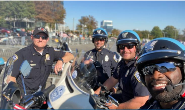
Members of ACPD competed in the 2022 Mid-Atlantic Police Motor Rodeo and placed 2 nd and 3 rd in the Novice Division! Motor officers throughout the area put their skills to the test during the competition.