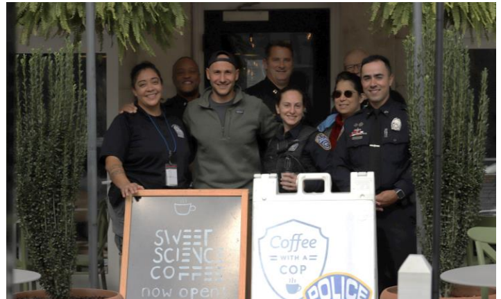
ACPD's Community Engagement Division celebrated National Coffee with a Cop Day by hosting two events for community members to get to know the officers, ask questions and voice concerns.