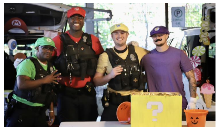
Officers dressed up as Mario and friends and distributed candy during the Arlington Parks and Recreation Trunk or Treat event at Lubber Run Community Center on October 22.