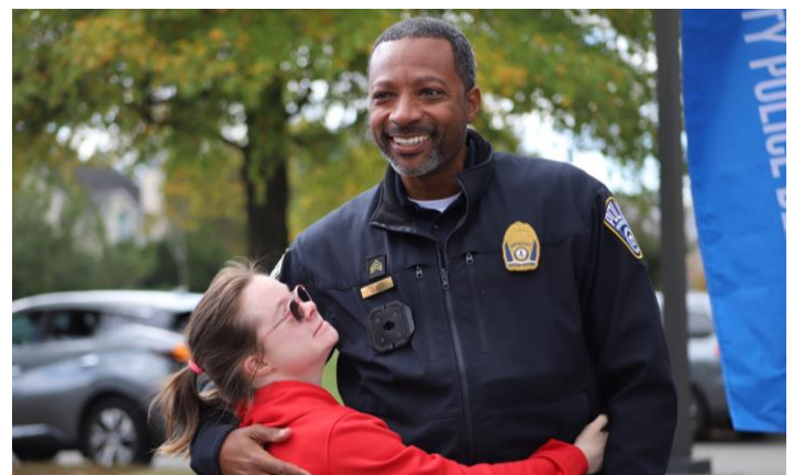
On October 8, ACPD partnered with the Arc of Northern Virginia to give persons with disabilities and their family members an opportunity to practice traffic stops and engage with public safety personnel.