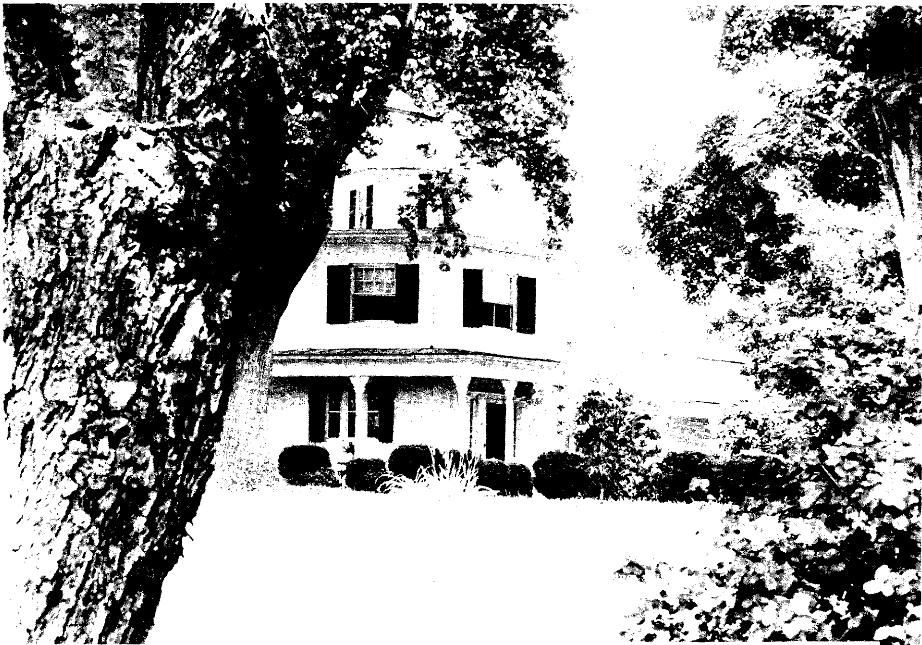
Caleb Cushing House, The Glebe, Arlington, Virginia