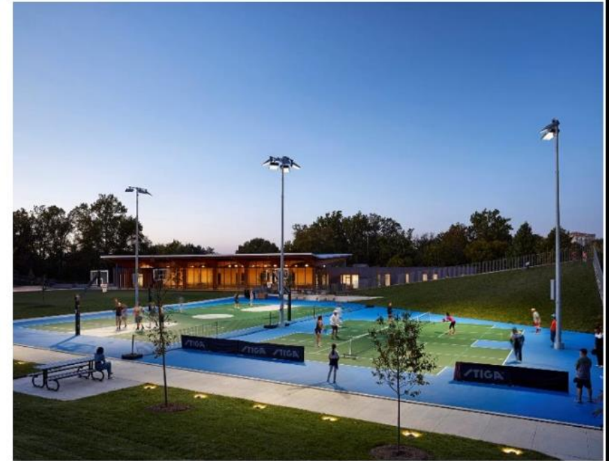
Multi-Use Courts at Lubber Run