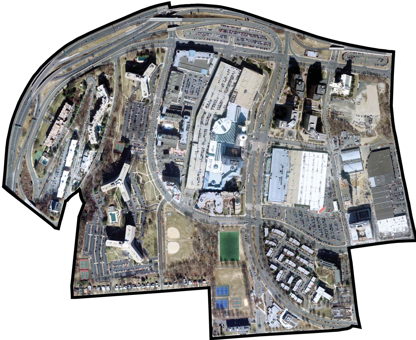
Aerial Photography flown February 2009.