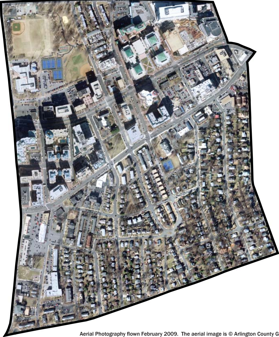
Aerial Photography flown February 2009. The aerial image is © Arlington County GIS Mapping Center.