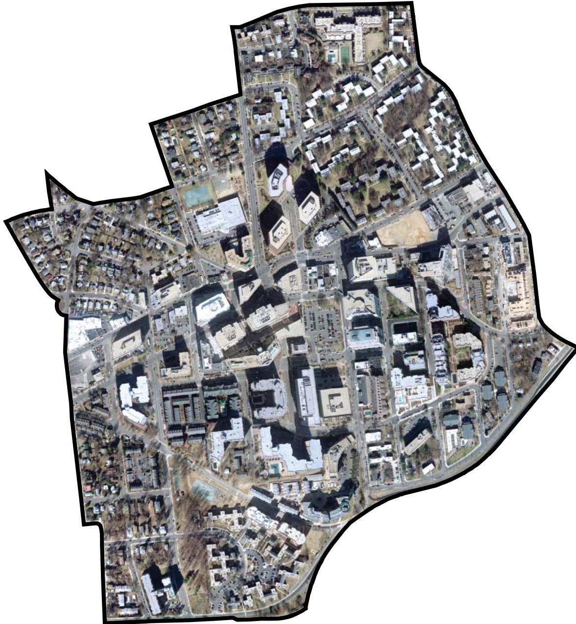
Aerial Photography flown February 2009. The aerial image is © Arlington County GIS Mapping Center.