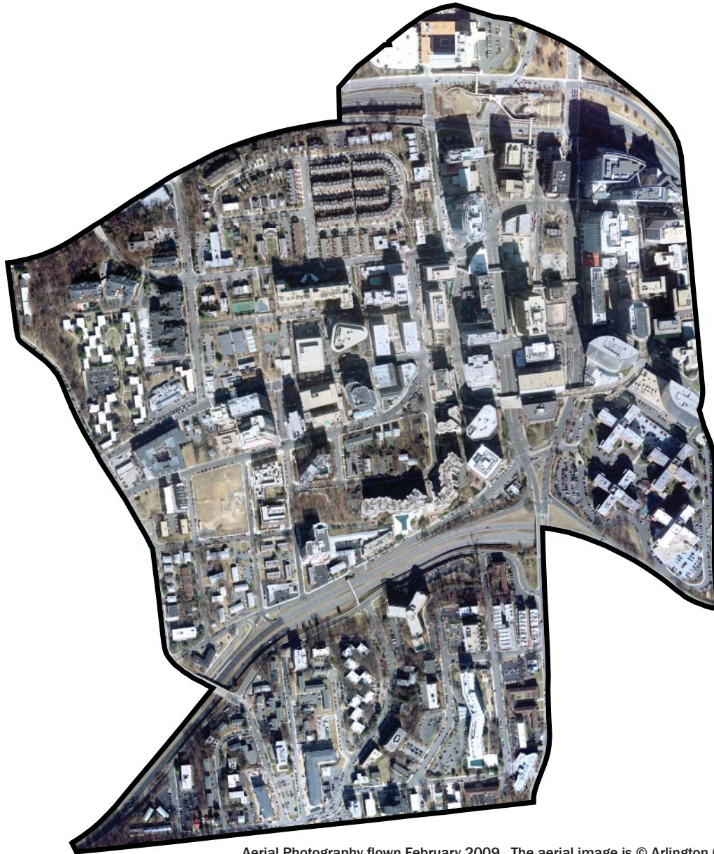
Aerial Photography flown February 2009.