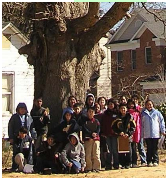
5th grade students at Carlin Springs Elementary School in front of an award-winning Quercus alba (White Oak)

Help us add to this wonderful collection!