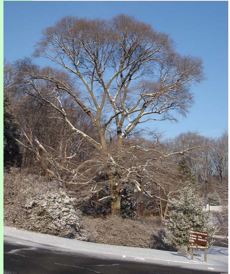
Nyssa sylvatica (Black gum) in the front of the Church of the Covenant on Military Road

Check out the list of existing Notable Trees of Arlington County, or get a Notable Tree Nomination form at www.arlingtonva.us/prcr , and click on All About Trees.